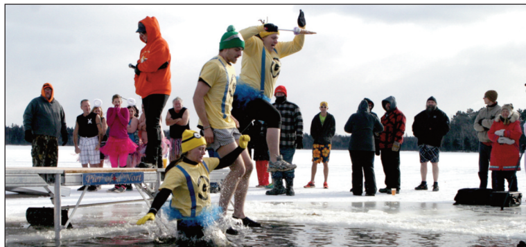
2017 17th annual Polar Bear Plunge