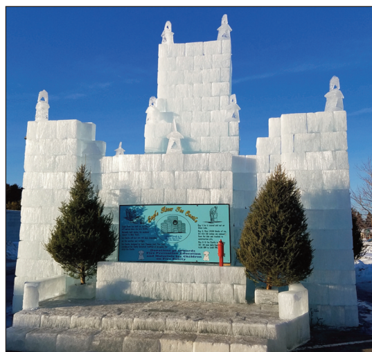
WRJO's first bridal Fair was held January 28 and Eagle River's Ice Castle built by the local Fire Dept. and volunteers.